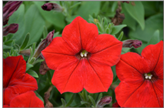
Easy Wave Red Petunia flowers

This plant will require occasional maintenance and upkeep. Trim off the flower heads after they fade and die to encourage more blooms late into the season. It is a good choice for attracting hummingbirds to your yard, but is not particularly attractive to deer who tend to leave it alone in favor of tastier treats. It has no significant negative characteristics.